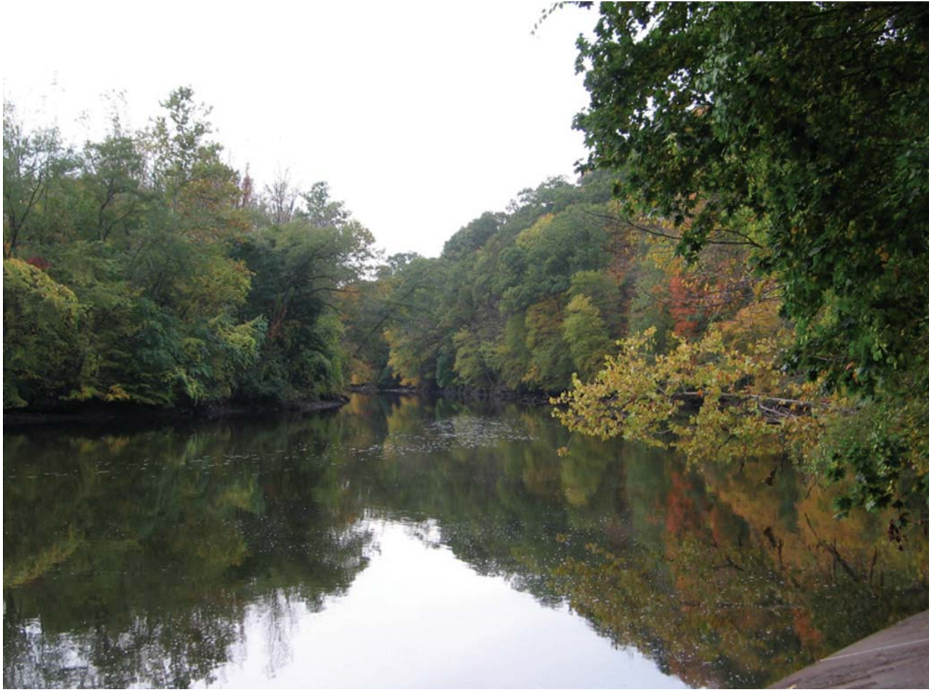
Wappinger Creek, Wappingers Falls